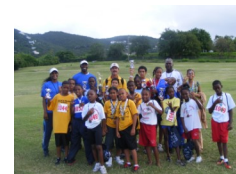
Team St. Croix